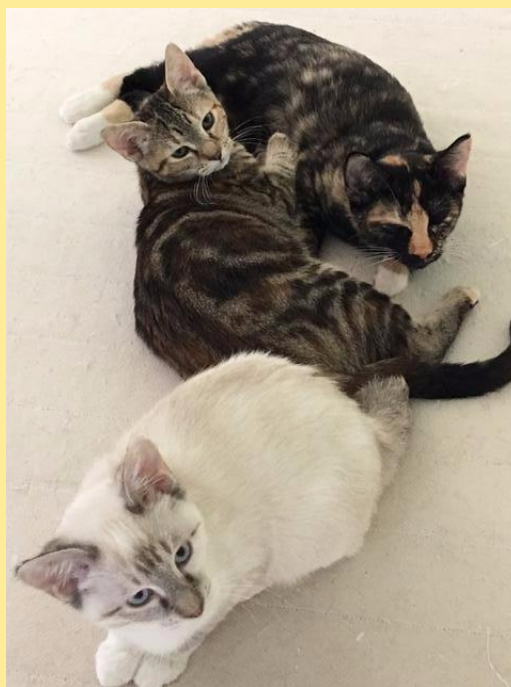
Three lucky kitties!

Whether known as a "tierce" in China, a "trio ordre" in France, or "trifecta" in the US, these