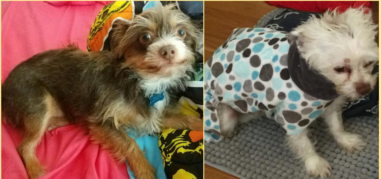
Buster and Scooter

These 2 little buddies were also found together as strays, roaming the streets, hungry and dirty. A Good Samaritan with dog fostering experience found them and tried locating their possible family in hopes they were just lost. After considerable time and realizing nobody was coming forward for these two, she contacted Paws in Need to utilize our low cost spay/neuter program to get them both fixed before finding them new homes.