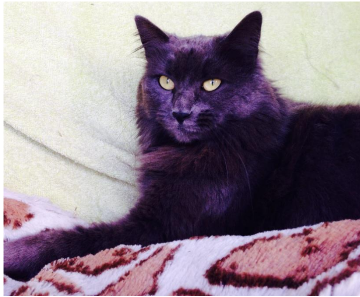
Ready for Love