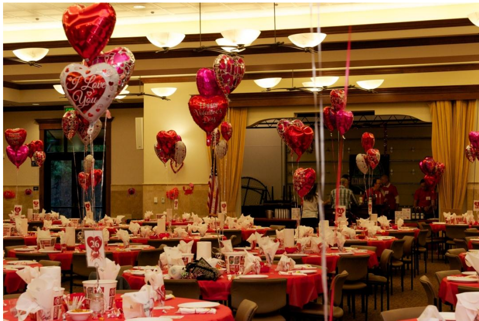
Decorated and ready for the Paws In Need Valentine Crab Feed to begin