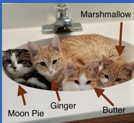
Marshmallow Moon Pie Ginger Butter