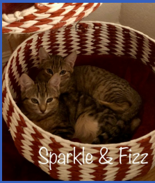
Sparkle & Fizz