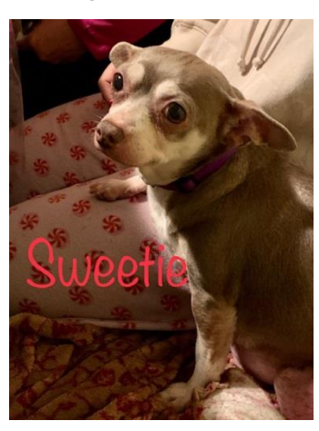
she's very sweet!

This girl was roaming the streets of Livermore for a few months, eating food